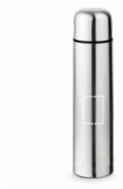
PAD PRINTING Thermal bottle | Cup 30 x 40 mm