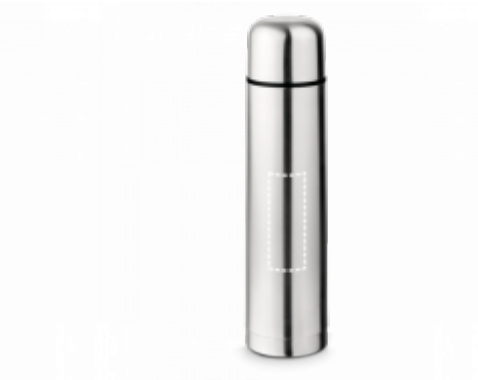
LASER Thermal bottle | Cup 30 x 80 mm