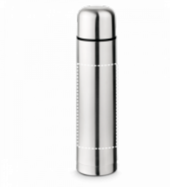
CYLINDRICAL UV Thermal bottle | Cup 250 x 190 mm