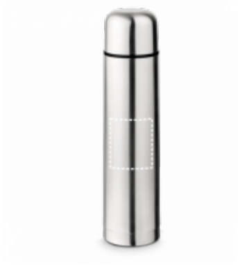
SCREEN PRINTING Thermal bottle | Cup 60 x 70 mm