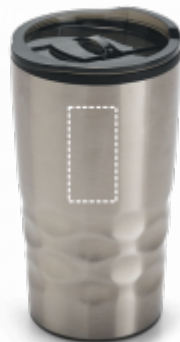
PAD PRINTING Cup | Top cup 25 x 50 mm