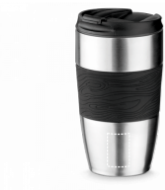
PAD PRINTING Mug | Bottom cup 20 x 30 mm