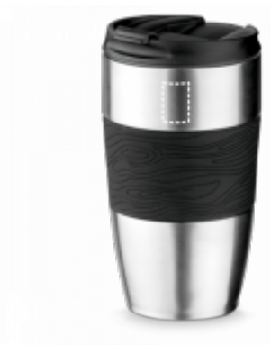
PAD PRINTING Mug | Top cup 20 x 30 mm