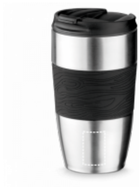
LASER Mug | Bottom cup 20 x 30 mm