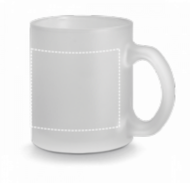
FIRING Mug | Cup 210 x 75 mm