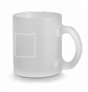
PAD PRINTING Mug | Cup 35 x 40 mm