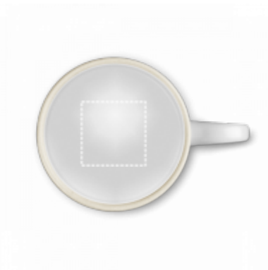
FIRING Mug | Bottom 50 x 50 mm