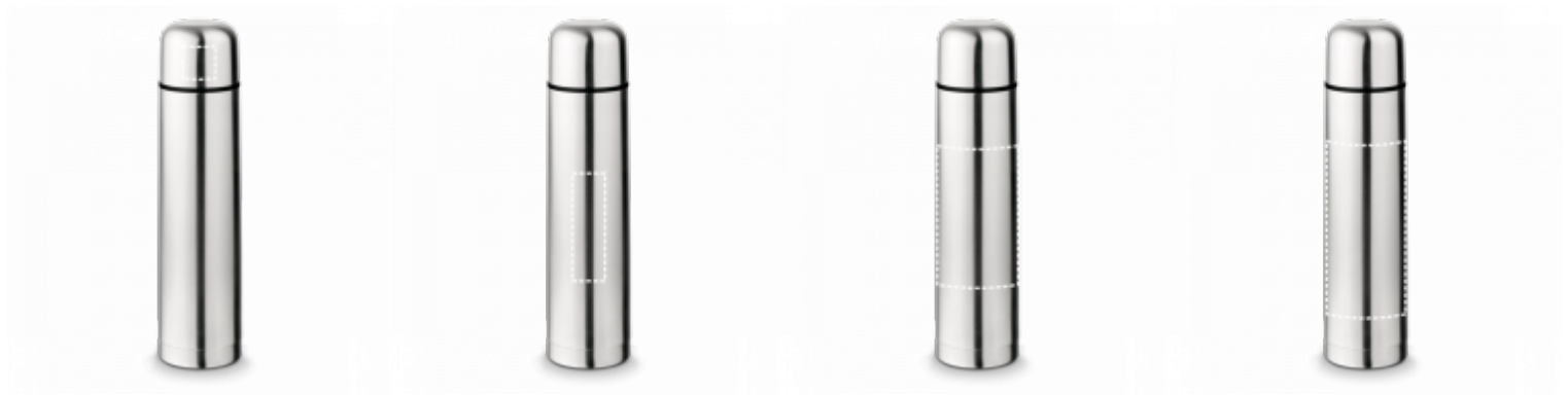
LASER Thermal bottle | Bottle lid 40 x 40 mm