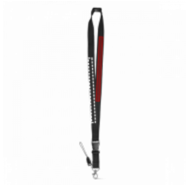
TRANSFER Lanyard | Lanyard 280 x 16 mm