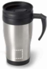
PAD PRINTING Mug | Bottom cup 30 x 25 mm